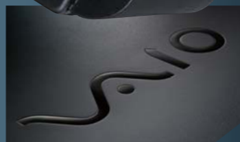
VAIO mirror logo in black

Sony recommends Windows Vista™ Business.