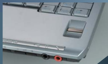
Frontal headphone jack Convenient Mute button and Volume buttons Convenient fingerprint recognition