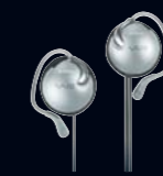
Supplied open-air, overhead headphones MDR-Q22LP/S02