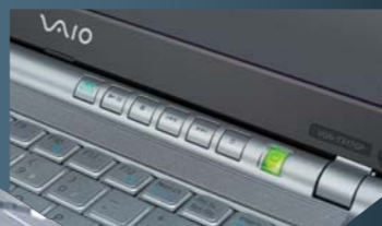
Unique AV buttons