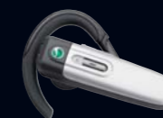
Recommended headset Sony Ericsson HBH-PV705* * Availability depends on region.

* Estimated battery life under JEITA Battery Run Time Measurement Method (ver. 1.0) when the power-saving mode is on. Actual battery life may vary with different operating conditions and settings.